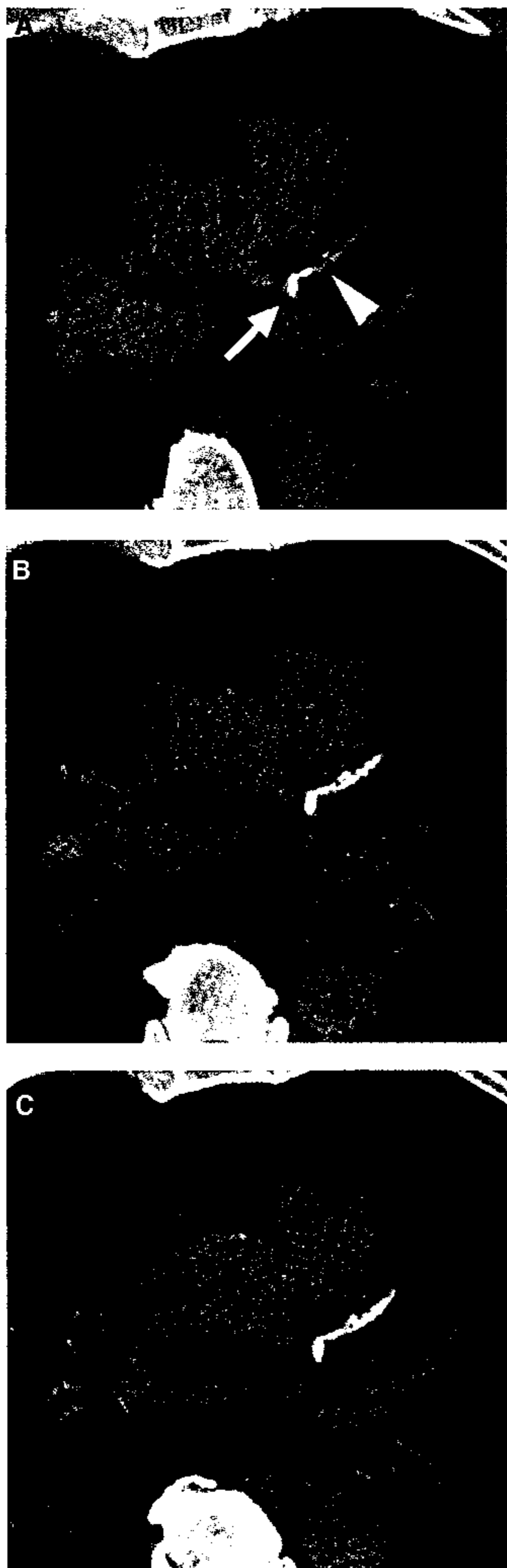
Figure 1. Axial cross-sections (3-mm slice thickness) obtained by electron beam tomography in a 63-year-old patient at baseline (A), after 12 months without lipid-lowering treatment (B), and after 12 months of treatment with cerivastatin. The images show calcifications in the bifurcation of the left main coronary artery (arrow) and proximal left anterior descending coronary artery (arrowhead). Although an obvious increase can be seen from the first to the second EBT scan, there is only a slight increase from the second to the third EBT scan. Total volume score in EBT scan 1, 1143 mm 3 ; in scan 2, 1488 mm 3 ; and in scan 3, 1511 mm 3 .